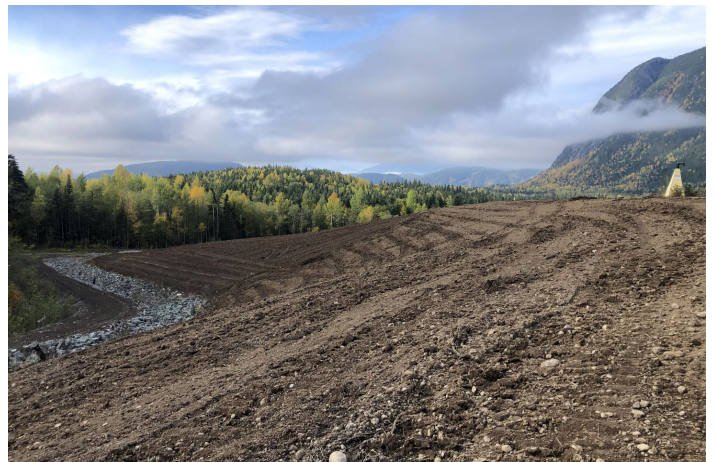
West (top) and east (above) facing views of the closed landfill.