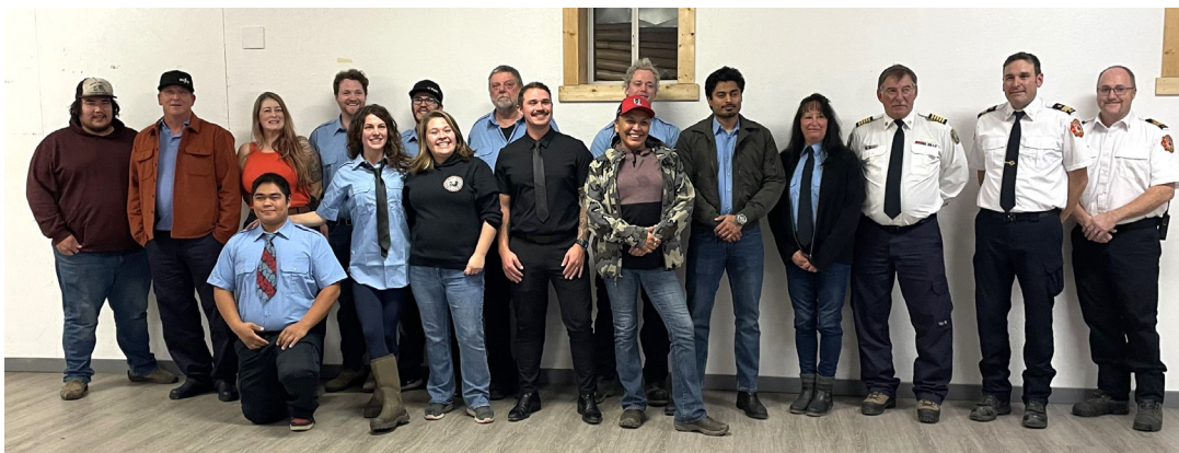
Members of the Dease Lake Volunteer Fire Department and Thornhill Volunteer Fire Department.